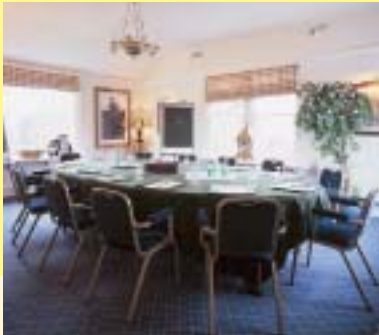
JAMES BRAID ROOM

Set as a boardroom with seating for up to 12 around one oval table, this room provides the perfect atmosphere for developing creative thought and inspired brainstorming.