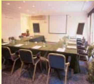
HARRY VARDON ROOM

Adjacent to the restaurant, refreshments can be taken overlooking the 18th Hole of Bushey Hall Golf Club.