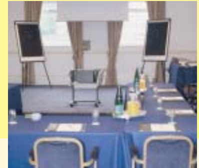
J.H. TAYLOR ROOM

With a break-out to a private patio and easy access to the adjoining lounge, the option for separate syndicate meetings in these areas is ideal for groups using this room.